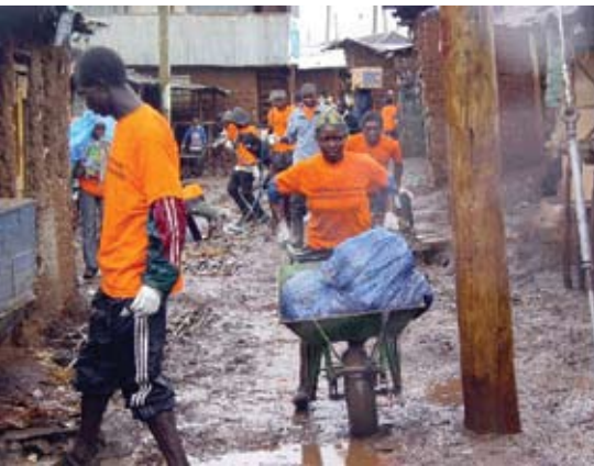
Swart's study revealed that clean-up activities in a Nairobi slum mean different things to boys than girls.