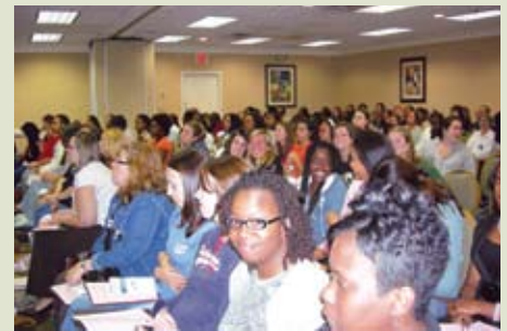
Students attend a training on advocacy.