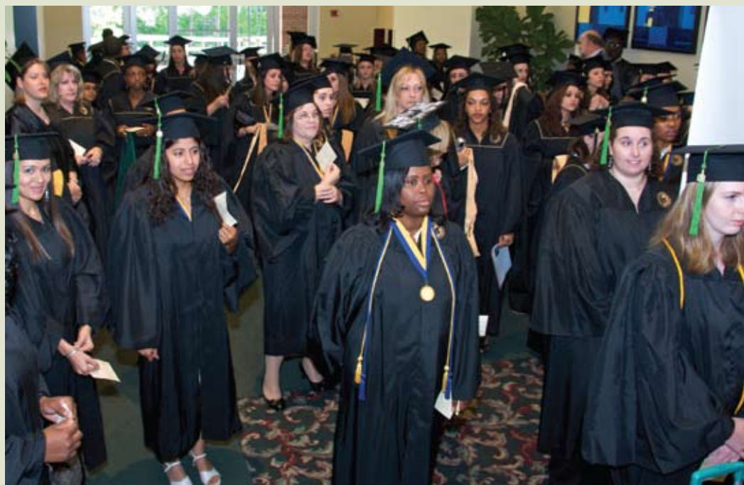
B.S.W. graduates (with green tassels) and M.S.W. graduates (with black tassels and holding gold "hoods") prepare to enter the Student Union's Pegasus Ballroom for the Graduation Celebration.