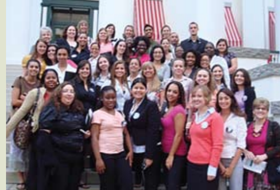
The UCF contingency poses on the steps of the Florida Capitol during Lobby Day 2008.

the students were able to provide legislators with fact sheets about these and other legislative goals. Included was a fact sheet on a Professional Social Worker Identification bill that will make it a law that only those with a degree in social work may use the title of "social worker."