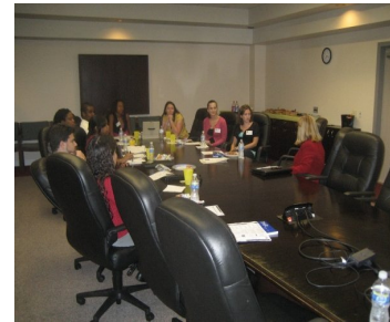
Thank you for a successful October guest speaker event!

The next MPASA event will be the Public Service Career Showcase on Thursday November 12 from 10am to 2pm in the Student Union/Pegasus Ballroom. This event is open to all UCF students and focuses not only on recruitment of professionals, volunteers and interns but also providing opportunities to explore career options in the public, non-profit and health sectors. We already have some great community partners committed and anticipate even more. Come out and meet your local organizations/agencies and network! Dress Professional =)