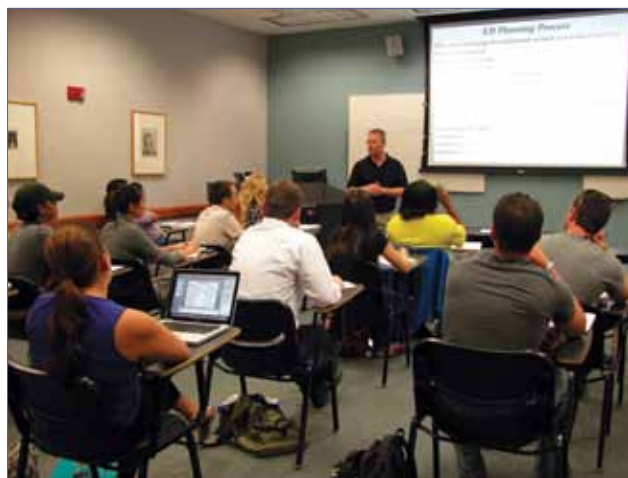
Hawkins teaches a class on U.S. economic development planning processes.