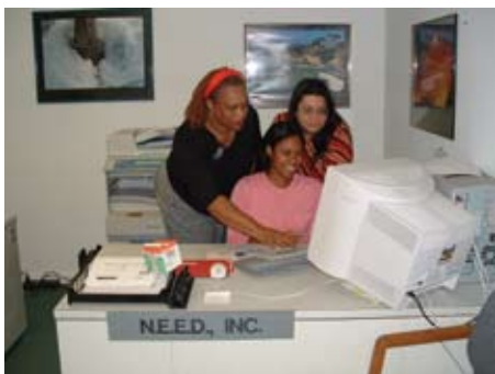
Nehemiah Educational and Economic Development, known as N.E.E.D., was one of eight nonprofits to benefit from UCF's assistance. N.E.E.D. works with individuals who have been impacted by the AIDS epidemic.