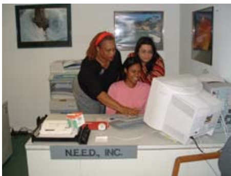
Nehemiah Educational and Economic Development, known as N.E.E.D., was one of eight nonprofits to benefit from UCF's assistance. N.E.E.D. works with individuals who have been impacted by the AIDS epidemic.