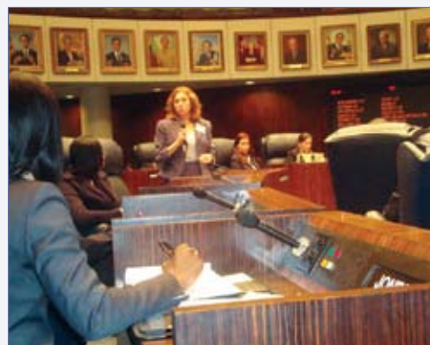
Mock debate at the Senate