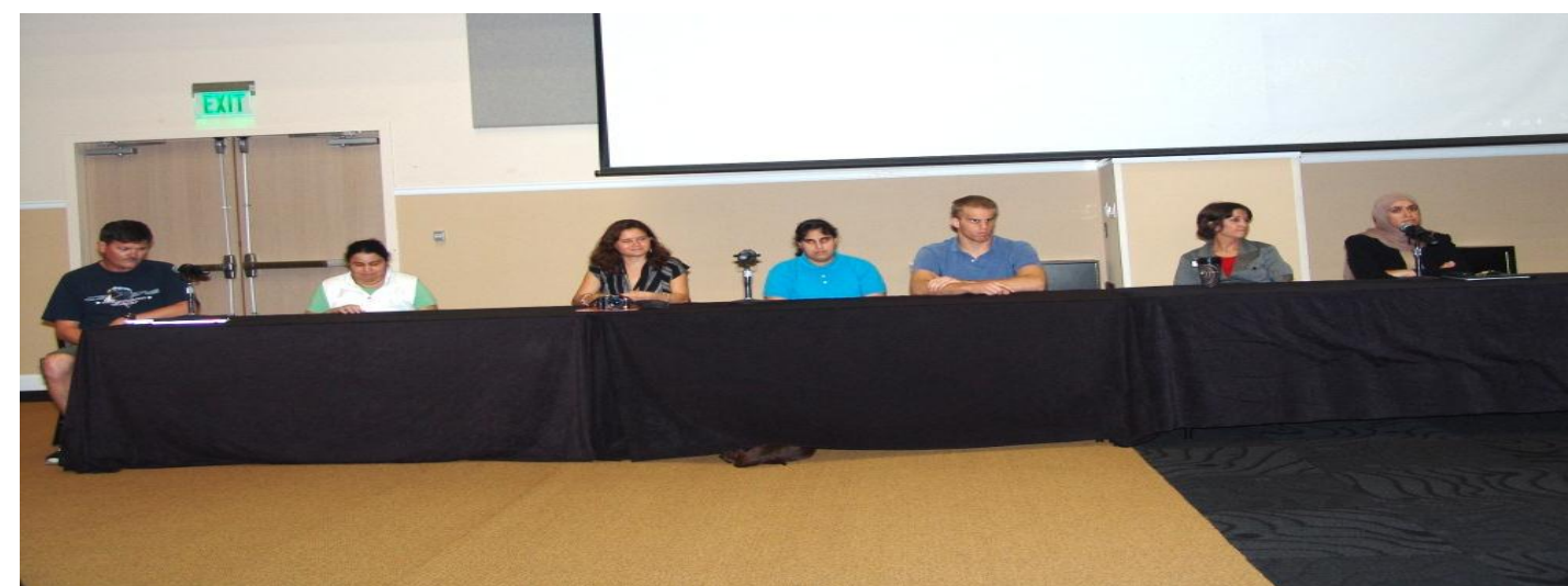
Panel participants: UCF students and faculty, and Lighthouse Central Florida