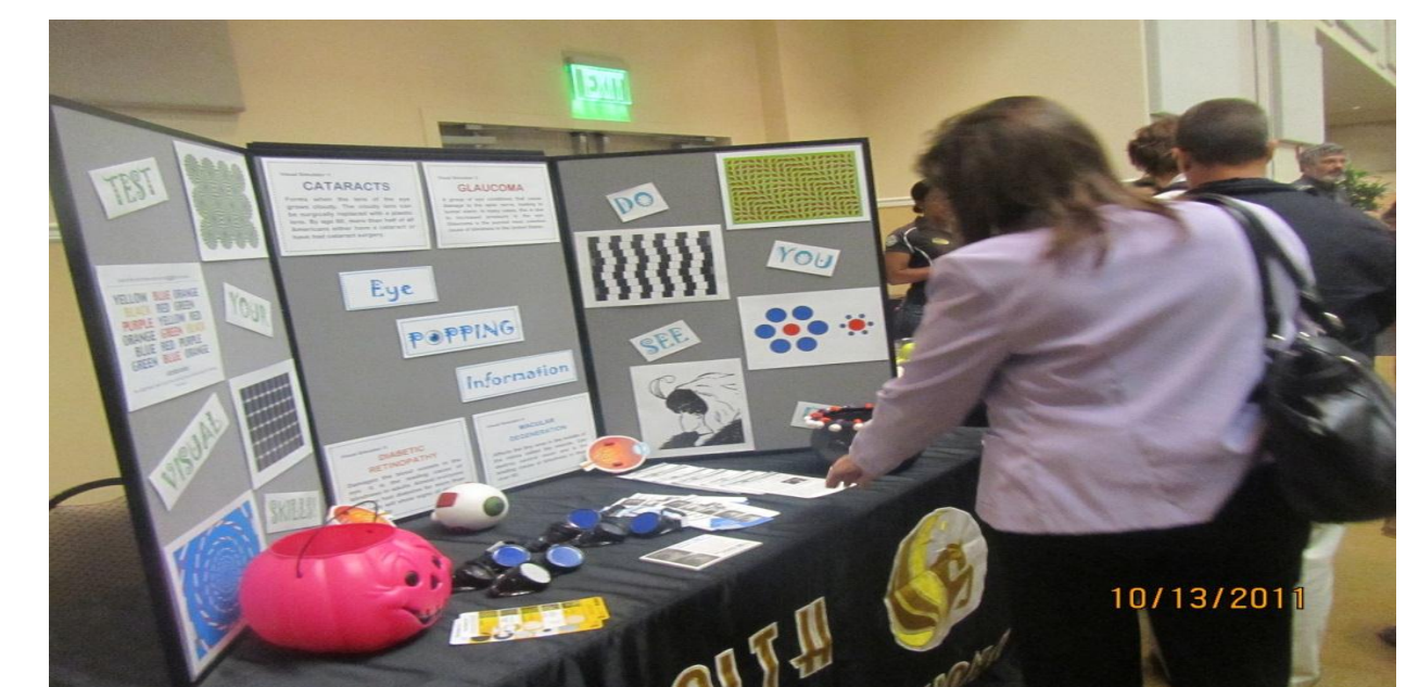
Poster session-World Sight Day