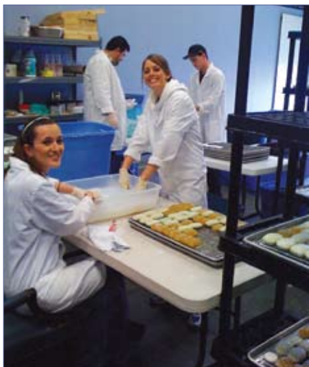
MPASA volunteers helping to sanitize hand soap for earthquake victims in Haiti